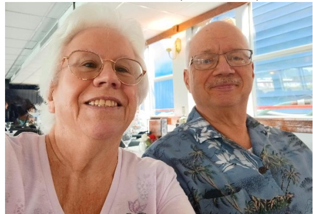
46 th anniversary river cruise