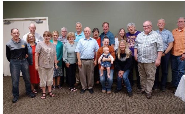
Grace Life Church (Minnesota)

Good health and ministry opportunities. Continued progress on the commentary. Expanded distribution of Living Waters . Continued financial support.