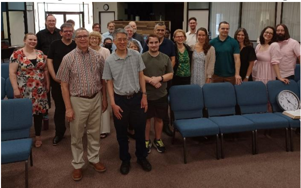
Vista Ridge Bible Fellowship (Texas)

Work continues. Solomon put it well, "Of making many books there is no end , and much study is wearisome to the flesh ." (Eccl 12:12). A balance exists between aiming at completeness and aiming at bringing it to completion. Some commentary content will appear first as journal articles. Trimming the schedule will enhance writing.